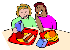
Lunch and Snack times